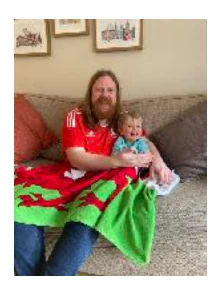
Football and Wales.